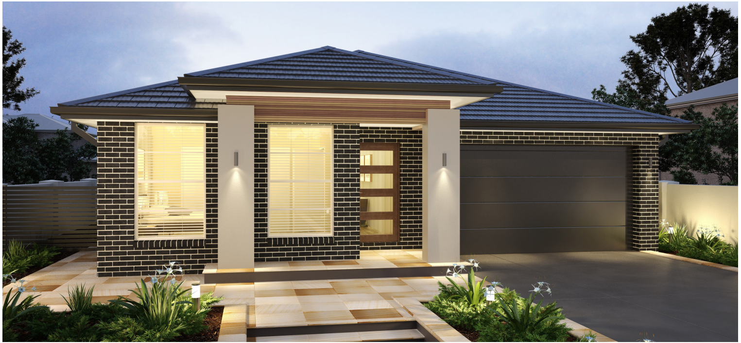
ARTIST IMPRESSION ONLY. GLEBE FAÇADE AS ILLUSTRATED.